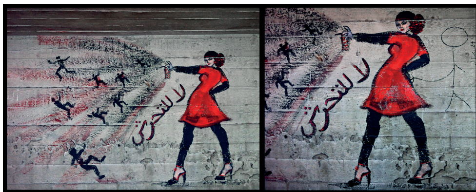
III. 1. Egyptian graffiti saying: “No to sexual harassment”

It is worth noticing that the practice of sexual assaults in Egypt has been systematically growing over the last few years. While in the past sexual assaults on women in the streets at other occasions than public gatherings were a rare practice, today all Egyptian women are sexually harassed: whether in small or big groups, young or old, wearing a veil or not 3 .