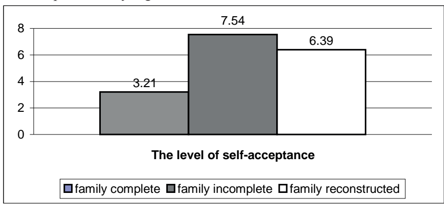
Figure 4. Variations of the average results as regards self-acceptance in the male groups.

Considering the influence of the family structure on the self-acceptance level in the tested men groups, a statistically significant difference was noticed (F=45.723;p=.0005). The results are presented by Figure 4 and Table 4.