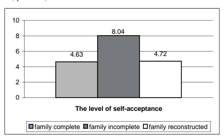
Figure 3. Variations of the average results as regards self-acceptance in the surveyed female groups.

The research results presented below (Figure 3 and Table 3) concerning variations in the self-acceptance for the female groups pointed to a statistically significant difference (F=32.664; p=.0005).