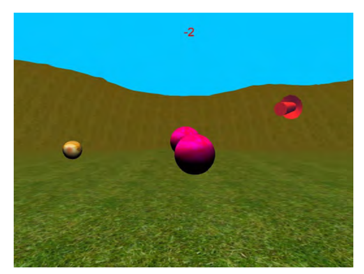
Fig. 3. Screenshot from the game used in the study.

In the next stage of statistical analysis we investigated the relationship between the used interface and emotions experienced during the game. We did not find any statistically significant differences between two groups. Participants were experiencing similar levels of frustration/satisfaction and engagement while using both types of interface.