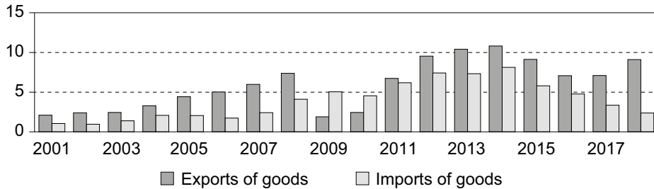
Figure 3. The value of Turkmenistan's total exports and imports of goods, 2010–2018 (in current billion USD)