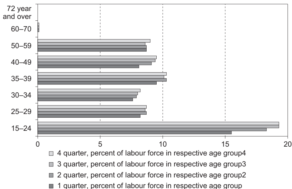
Figure 1. Dynamics of the number of unemployed in 2020 (by age groups)