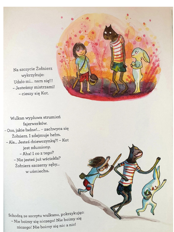
Figure 2 A