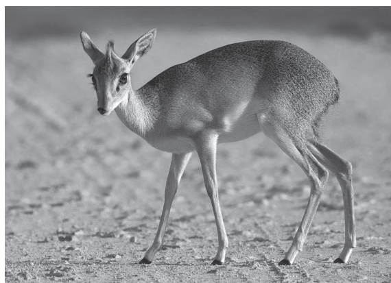
Fig. 2. Female dik-dik

the animal as a feline (lynx or caracal) 5 , although a lynx is depicted elsewhere in the frieze. The animal's features, however, point towards it being the dik-dik antelope (in particular the Madoqua kirkii , see fig. 2). Dik-diks are the world's smallest antelopes, with a very short tail and a large tuft on the crown of the head. The male has small horns that can be hidden in their tuft, while female dik-diks do not have horns at all, which suggests it is a representation of the female dik-dik.